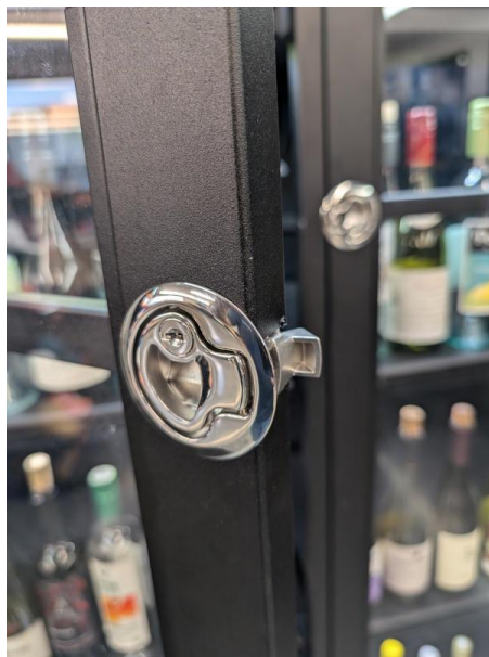
Close-up of our locking latches – photo of double door cabinet with 2 latches.