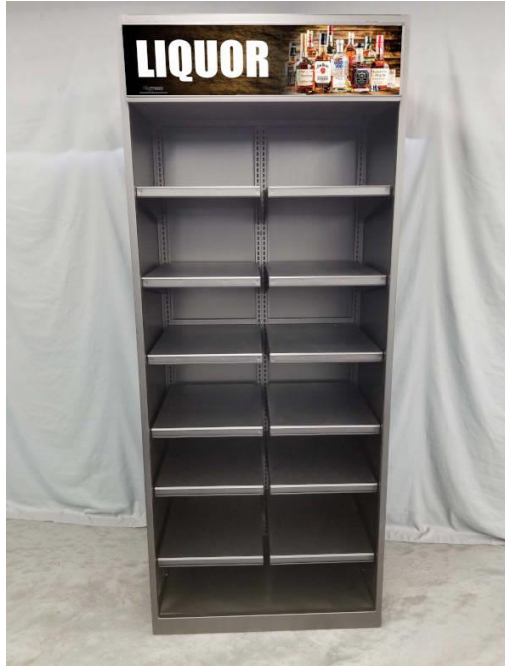
3ft x 90" x 22" with (12) side-by-side steel shelves + LED header...$1599