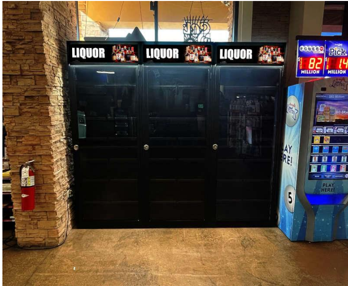
Custom 9ft x 94" set with locking doors + 12 side-by-side steel shelves + LED headers.....$5775.00