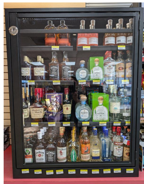
Custom countertop 3ft x 48" locking liquor cabinet + 6 side-by-side steel shelves, with LED shelving.....$1685.00

We can add security doors to any liquor cabinet. Single and double doors available. LED shelves and sign headers available. We build to suit, so contact us today for a custom quote.