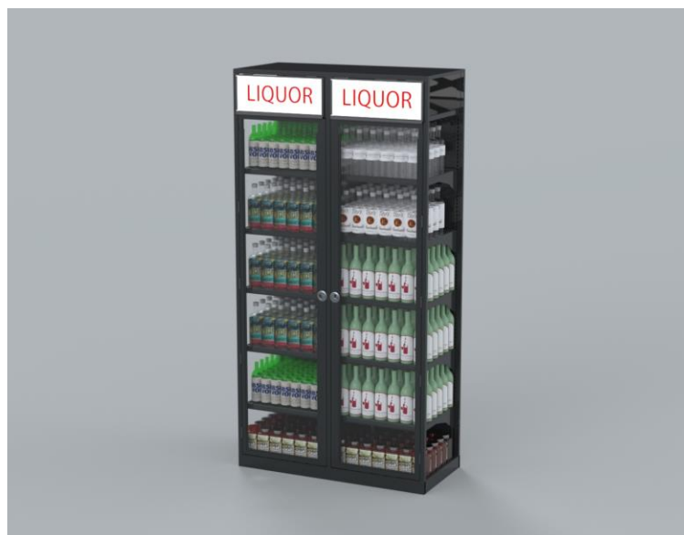
4ft x 90" liquor wall cabinet, open-sided with double locking doors +10 steel shelves & full LED signs & shelves.....$2440.00. Without doors.....$1965.00