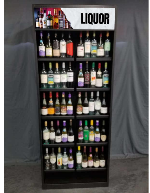
3ft x 90" x 22" with (10) side-by-side steel shelves + LED header....$1499