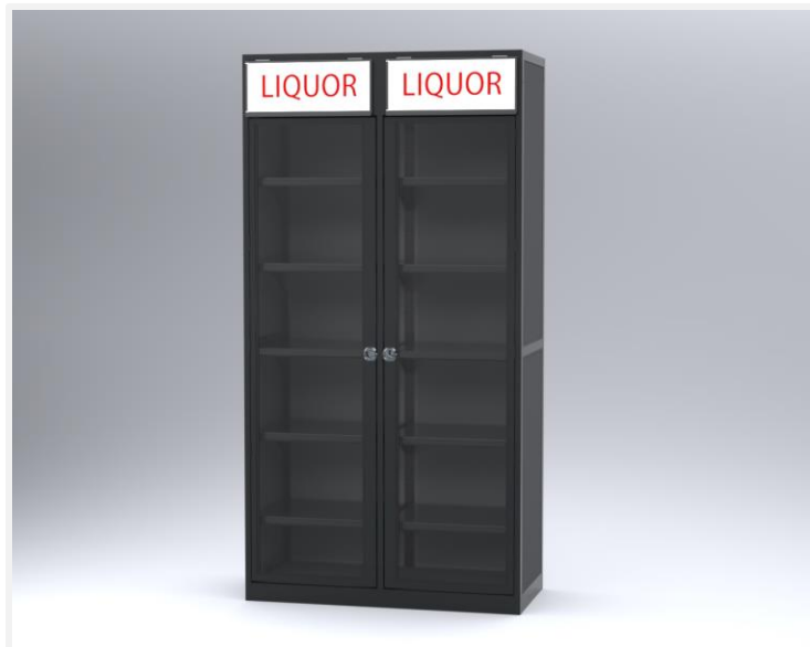
4ft x 90" liquor cabinet with end panel sides attached, double locking doors, +10 steel shelves & full LED signs & shelves.....$2440.00. Without doors.....$1965.00

Custom Locking Liquor Displays -2ft, 3ft, or 4ft wide, custom heights, 22" deep