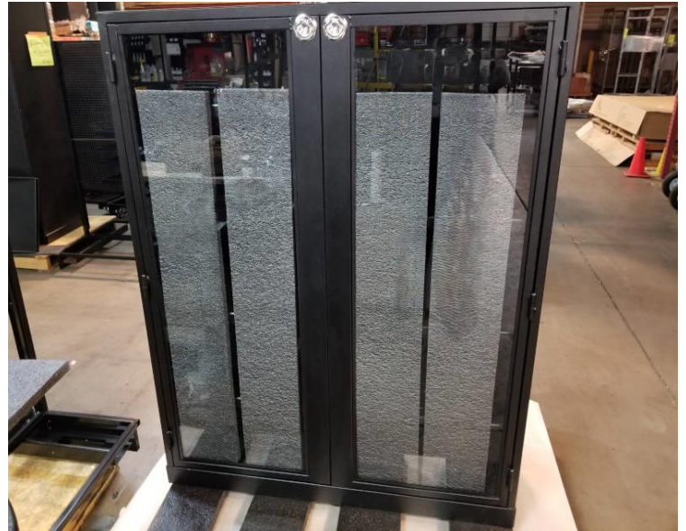
Custom 3ft x 64" cabinet with double locking doors + 6 shelves with LED shelving.....$1785.00